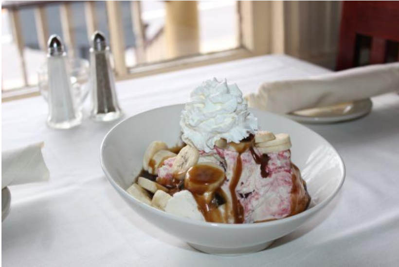
Banana Foster and Raspberry Truffle