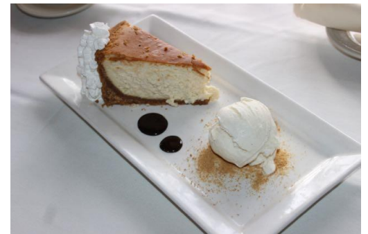
Vanilla Bean Cheesecake with Vanilla

Chef Nicki's Cheesecake is one of the most popular dessert options available at Braddock's Tavern and our spoon-first plunge into this elegantly plated treat was no disappointment. His signature Vanilla Bean Cheesecake was delightfully paired with a healthy-sized scoop of Bassetts Vanilla ice cream to create a taste sensation.